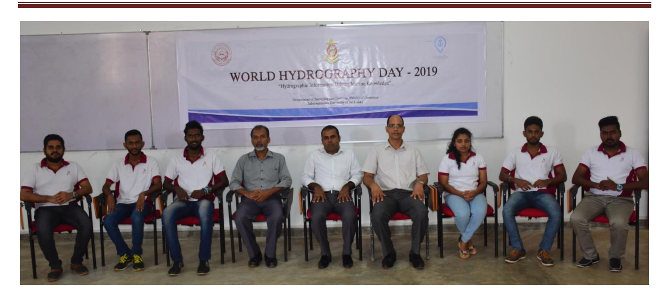
Group Photo of the Research Group 'Hydro Explorers' with Academic staff