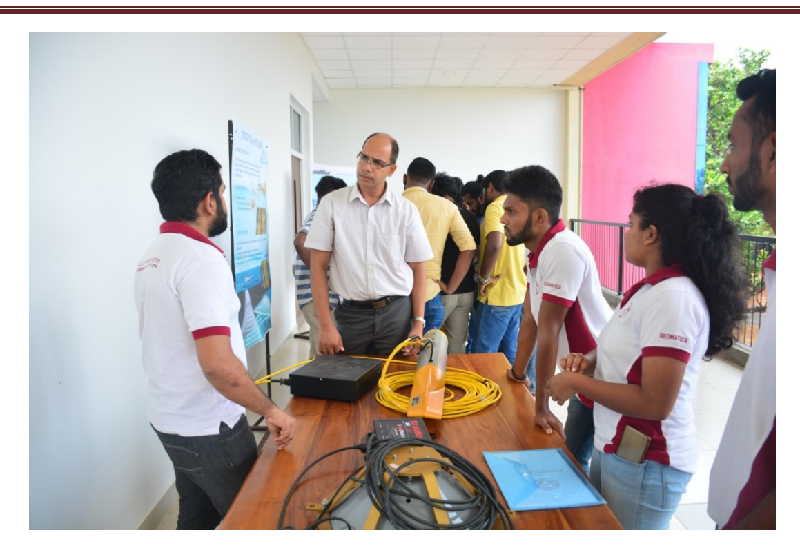
Glimpse of the Hydro Exhibition