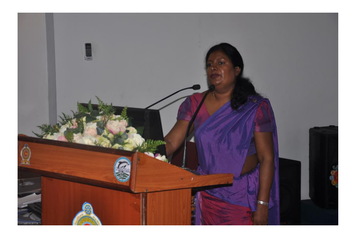
Presentations on Hydrography and introducing the theme of WHD, 2019