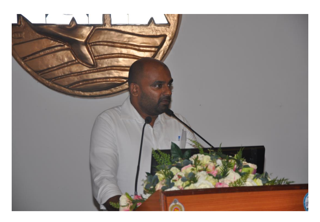
Key Note Address by the Actg. Chief Hydrographer