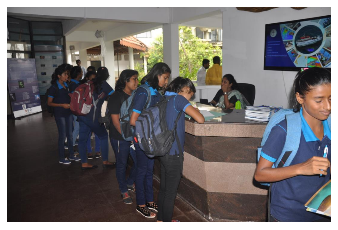
Registration for the Seminar