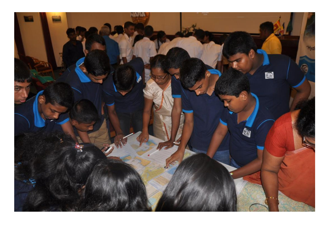
Hands on Cartography