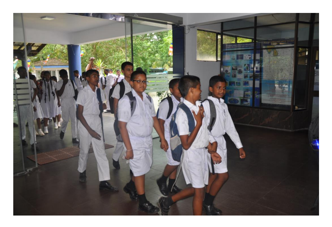
Arriving to the NARA Premises