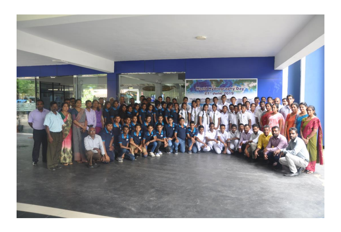
Student with NHO Staff