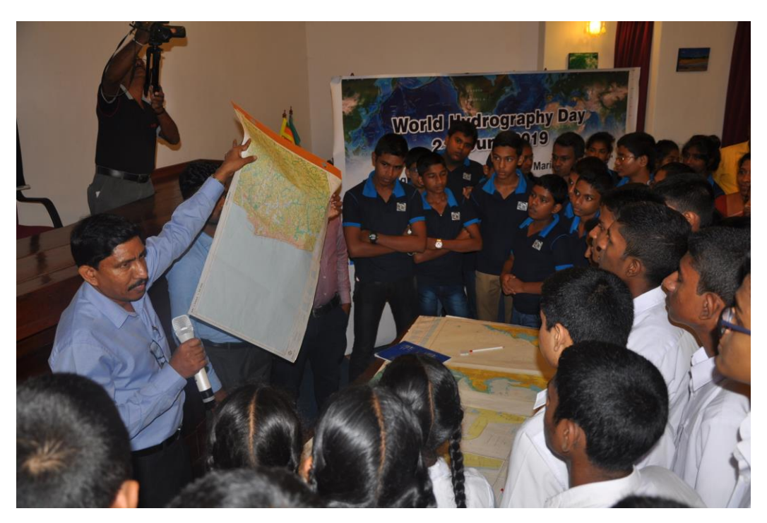
Explaining the Topographic Maps and Nautical Charts