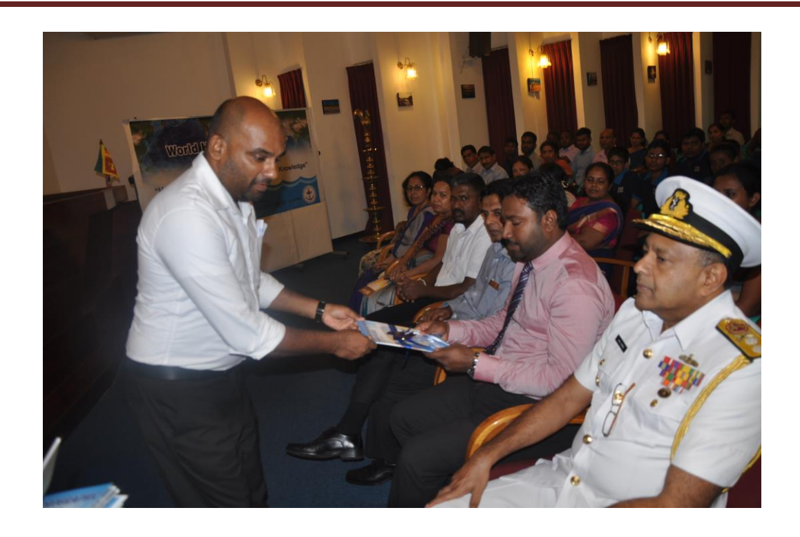
Presenting a NHO publication to Director General, NARA