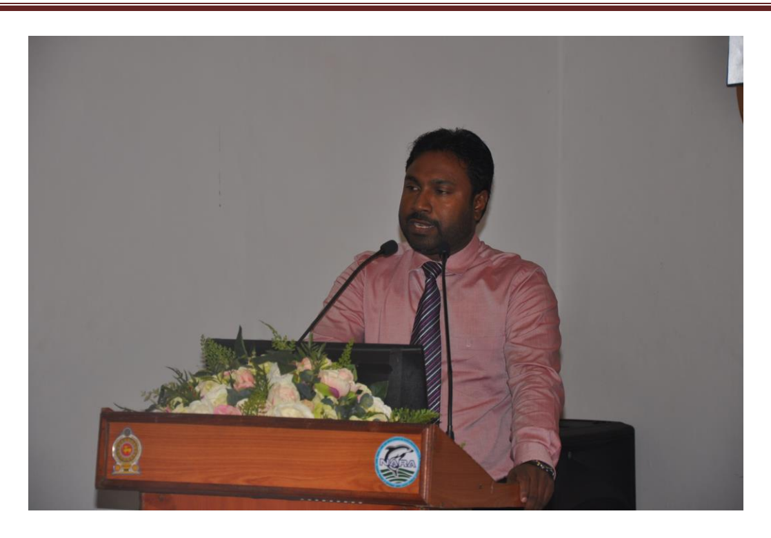
Address the gathering by the Chief Guest, Director General of NARA