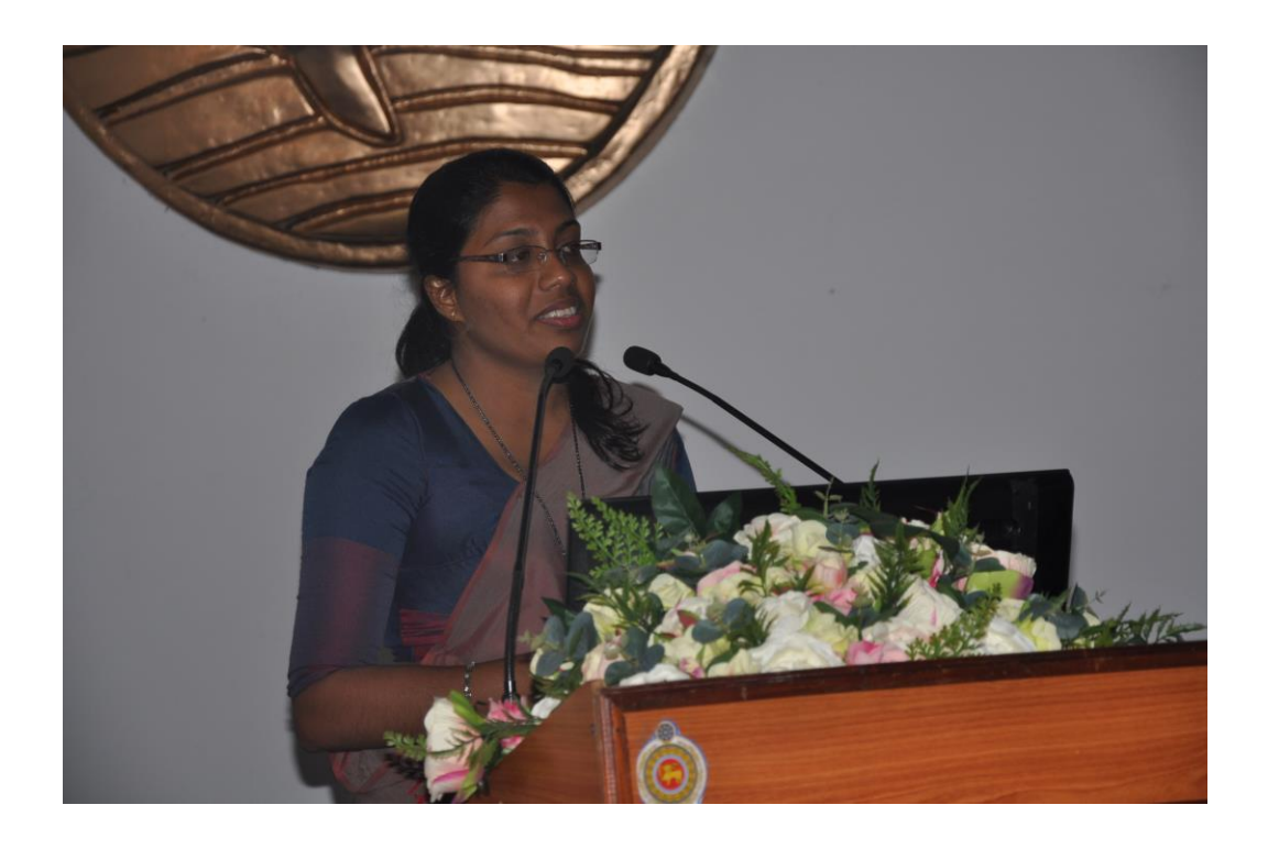
Presentations on Hydrography and introducing the theme of WHD, 2019