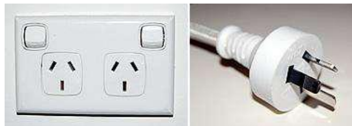
Australian outlet and power cord

Mains voltage in Australia is 230V 50Hz. Travellers from most nations in Asia, Africa and Europe should have appliances that work on the same mains voltage as Australia - therefore you will not need a voltage converter. Notable exceptions to this are Japan, USA and Canada which uses 100/120V 50/60Hz. If your country does not use appliances within the 230V 50Hz mains voltage range, you will need to purchase a voltage converter. You will also need a power adapter (see below). The plugs in Australia have two live flat metal pins shaped in an inverted "V" and a third flat pin in the centre.