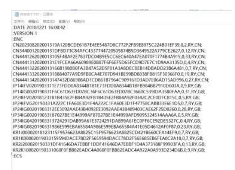
Fig. 3 Amendment of the Permit.txt file, the original Data Server ID was replaced by the Distributor ID (RY) and moved to the Comments section

To address the second obstacle, we have devised a way to integrate the data and permits from different DSPs such that the users could use the ENC data as if they are from a single source. Specifically, the method is to replace the ID of the DSPs in the "SERIAL.ENC" and "PERMIT.TXT" files of the S-63 IHO Protection Scheme with a two-character Distributor ID. The "Catalog.031" files, data sets and permits from different DSPs of the same period would then be merged without hampering the integrity of the chart data files, its signature files and the permits file encrypted portion. The processed package could then be loaded normally into ECDIS and it is backwards compatible with the present protection scheme. We believe that this approach would not undermine the copyright agreement and there are no data security risks. However, these two assumptions need to be extensively discussed.