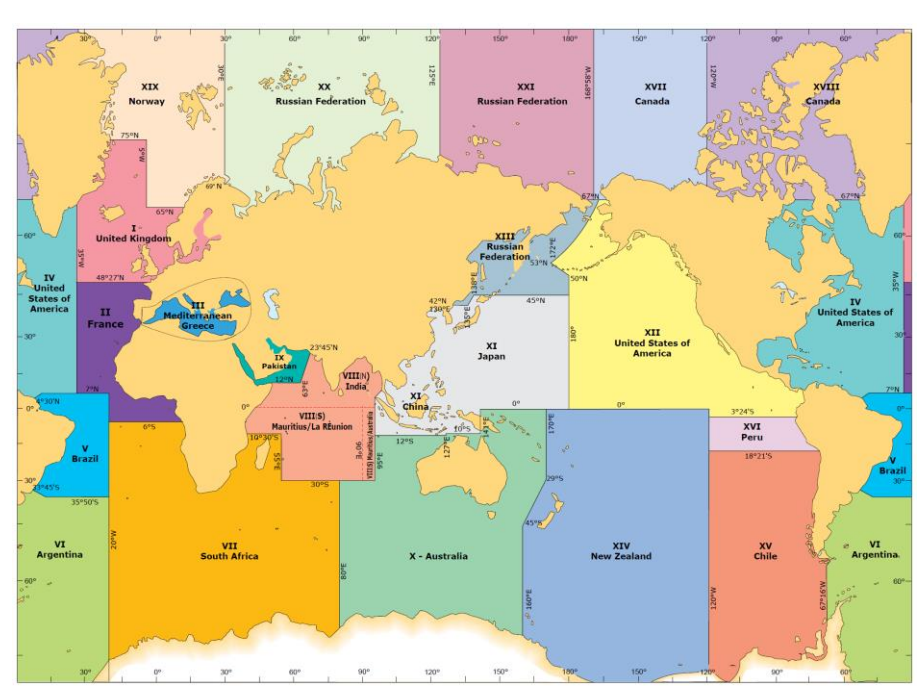
Figure 5-3 METAREAs for coordinating and promulgating meteorological warnings and forecasts under the World-Wide Met-Ocean Information and Warnings Service