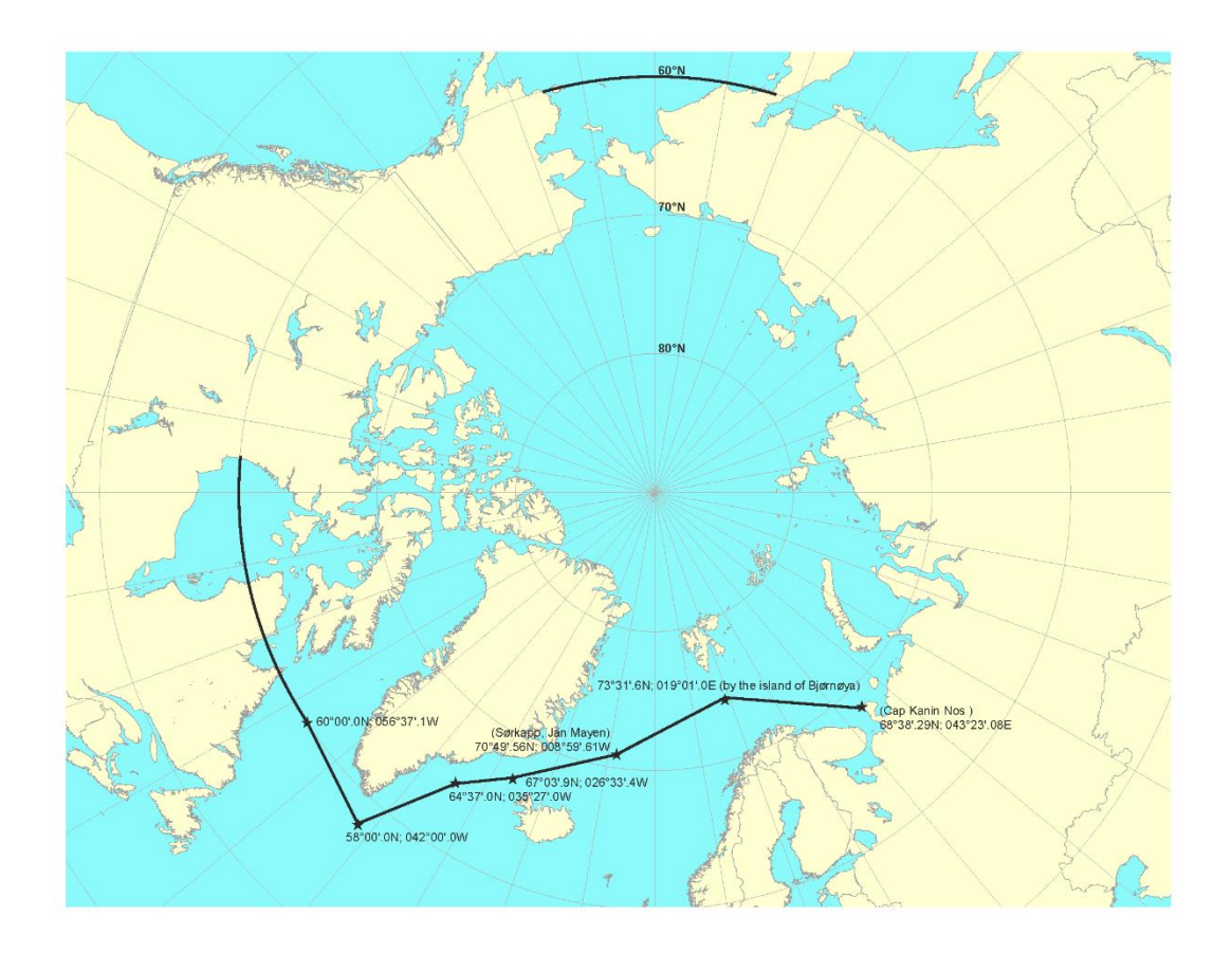
Figure 2 – Maximum extent of Arctic waters application<sup>3</sup>