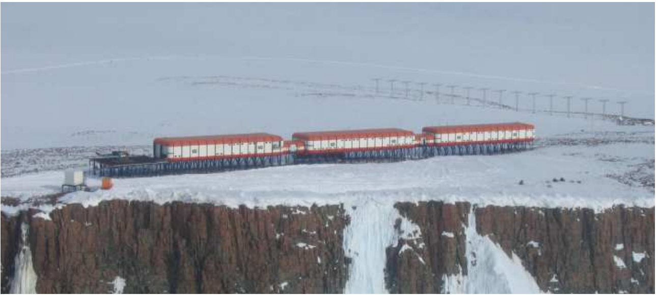
Figure 4. SANAE IV