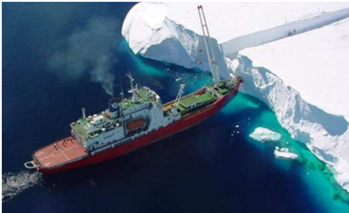
Figure 3. M/V SA AGULHAS