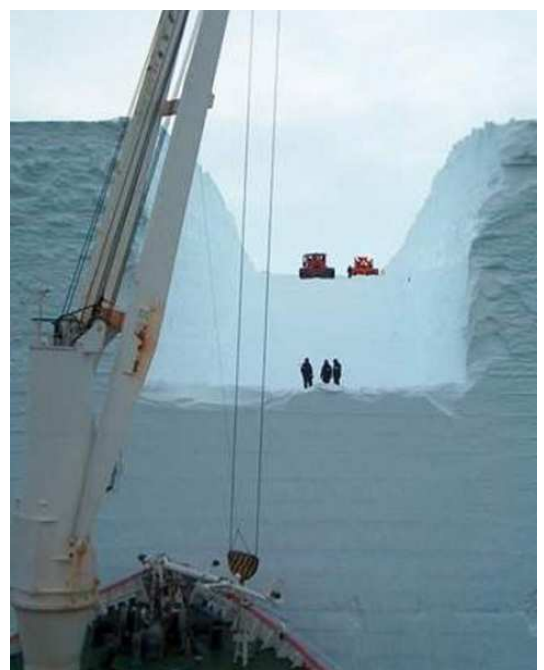
Figure 6 Offloading SANAE III

Since the summer season of 2004/2005, the MV AGULHAS discharged cargo at the Akta-bukta in the vicinity of the German research station Neumayer. Due to the ever-increasing height of the ice-shelf in the vicinity of the abandoned SANAE III (E-Base), it has become extremely dangerous to back-load and discharge cargo from the +32 metre high and very unstable ice-shelf. South Africa and Germany has exchanged source information in preparation of their published adjoining paper charts INT 9057, INT 9055 and ENCs. This has enhanced the existing co-operation between South Africa and Germany.