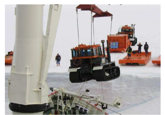
Figure 7. Offloading Akta-bukta

South Africa will welcome any additional survey data including satellite imagery (geo-referenced) within their charting area from neighbouring countries to update chart SAN 2004 (INT 9056) and ENC ZA300300.