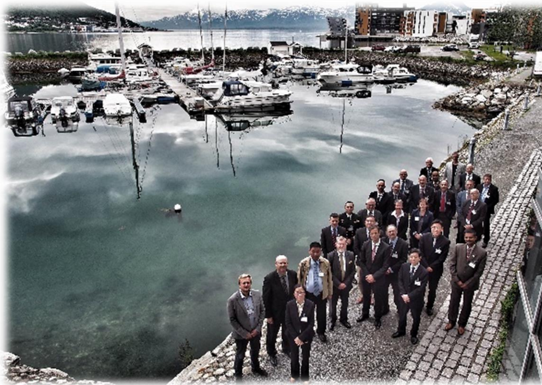
Participants gathered nearby the Fram Centre, Tromsø, Norway at the 14 th Conference of the IHO Hydrographic Commission on Antarctica