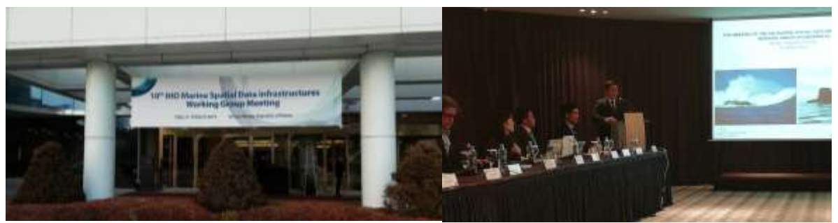
Figure 1. The IHO MSDIWG10 meeting in Busan.

The outcome of the meeting is available from the IRCC section of the IHO Website under the MSDIWG.