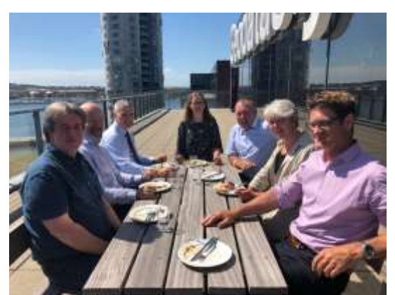
Figure 4. The BS-NSMSDIWG members attending the workshop.

The overall aim of the workshop was to create a common MSDI framework and to evaluate the BS-NS MSDI work plan for the Baltic Sea which focus on how the BSHC and NSHC can benefit from a regional approach to MSDI and to have a status on the different action items and agree how to proceed. Day 1 of the workshop included general presentation from the IHO MSDIWG and national presentation from BSHC and NSHC member states on SDI, MSDI, MSP and INSPIRE and other relevant issues. Day 2 of the workshop the MS focused on reviewing the action plan and the way forward, updating the work program, and planed actions in order to address how the BSHC and NSHC can benefit from a regional approach to MSDI in the future.