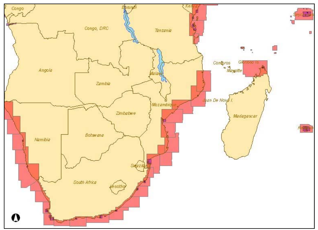
Figure 3: Medium and Large Scale Coverage

Medium scale coastal coverage also exists, and covers the coastline of mainland Africa from the northern border of Namibia round to Mozambique; the northern coastline of Tanzania; the entire Kenyan coastline; the Seychelles; Réunion Island; Mauritius; and Rodriguez Island (see figure 3 below). However, coastal coverage is missing for Angola, most of Madagascar, and the border region between Mozambique and Tanzania.