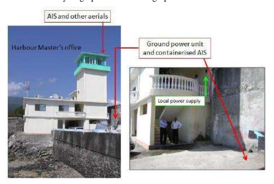
Moroni future AIS station (pending World Bank final agreement)

Comoros also hopes that the WIOMH project will finally install an AIS station in the port of Moroni. The World Bank expert seems to have approved the arrangements offered, while expressing reserves on the quality of the mains power supply, and interest in the idea of tasking a Comoran with performing the routine maintenance of the station. The person we have in sight has spent time onboard the Beautemps-Beaupré in 2010 and achieved successfully the French diploma of Aide-Hydrographe (assistant hydrographer). If agreed, she could reinforce the future Hydrographic and Oceanographic Centre.