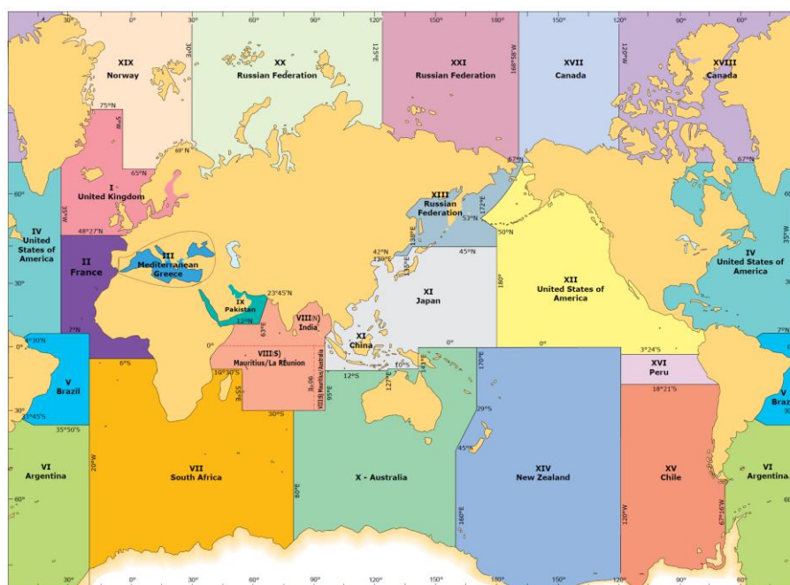
Figure 5-3: METAREAs for coordinating and promulgating meteorological warnings and forecasts under the World-Wide Met-Ocean Information and Warnings Service