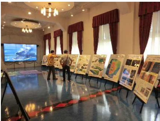
A scene of the exhibition of the WHD in 2015 at the 7 th Regional Coast Guard Hedaqarters, JCG About 1000 people visited the exhibition at Kanmon Straites Live Musium on 12-18 June 2015.