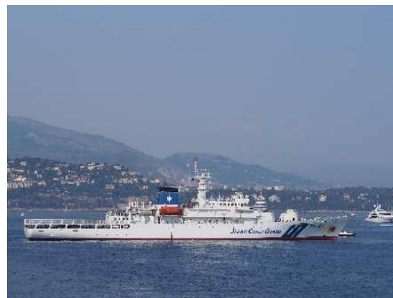
T/V Kojima leaving the Monaco Port for her next destination, the Singapole Port