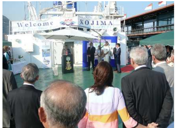
Celebration of the WHD in 2015 on T/V Kojima, Japan Coast Guard Academy