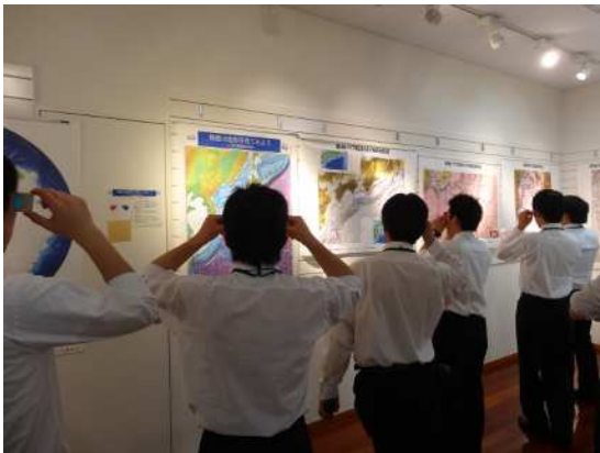
A scene of the exhibition of the WHD in 2015 at the JHOD Musiam Students of Fisheries High School in Hokkaido visited the exhibition.