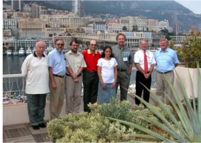
ICA, Commission on Spatial Data Standards Monaco, 5 - 9 July 2004