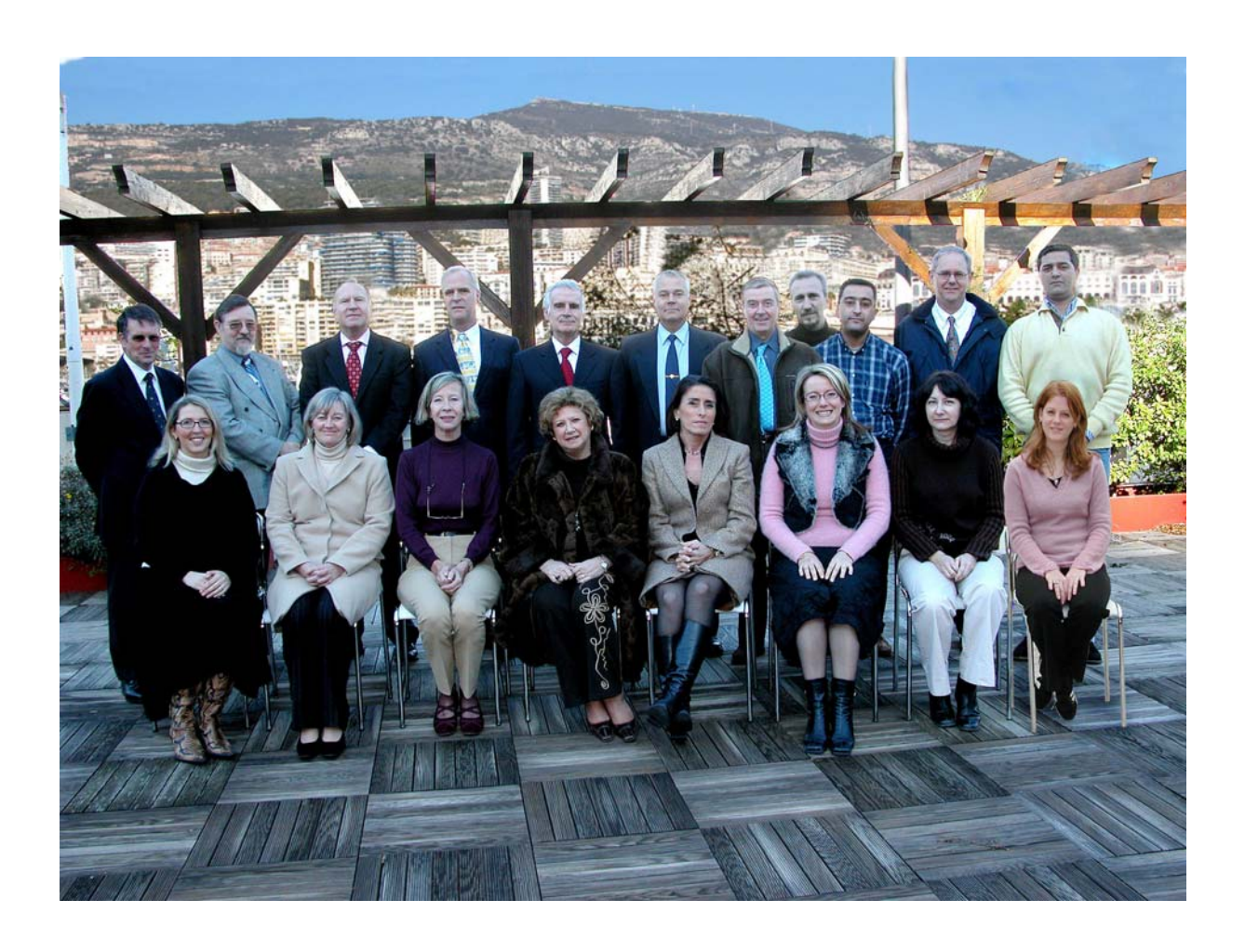
IHB Staff in 2006