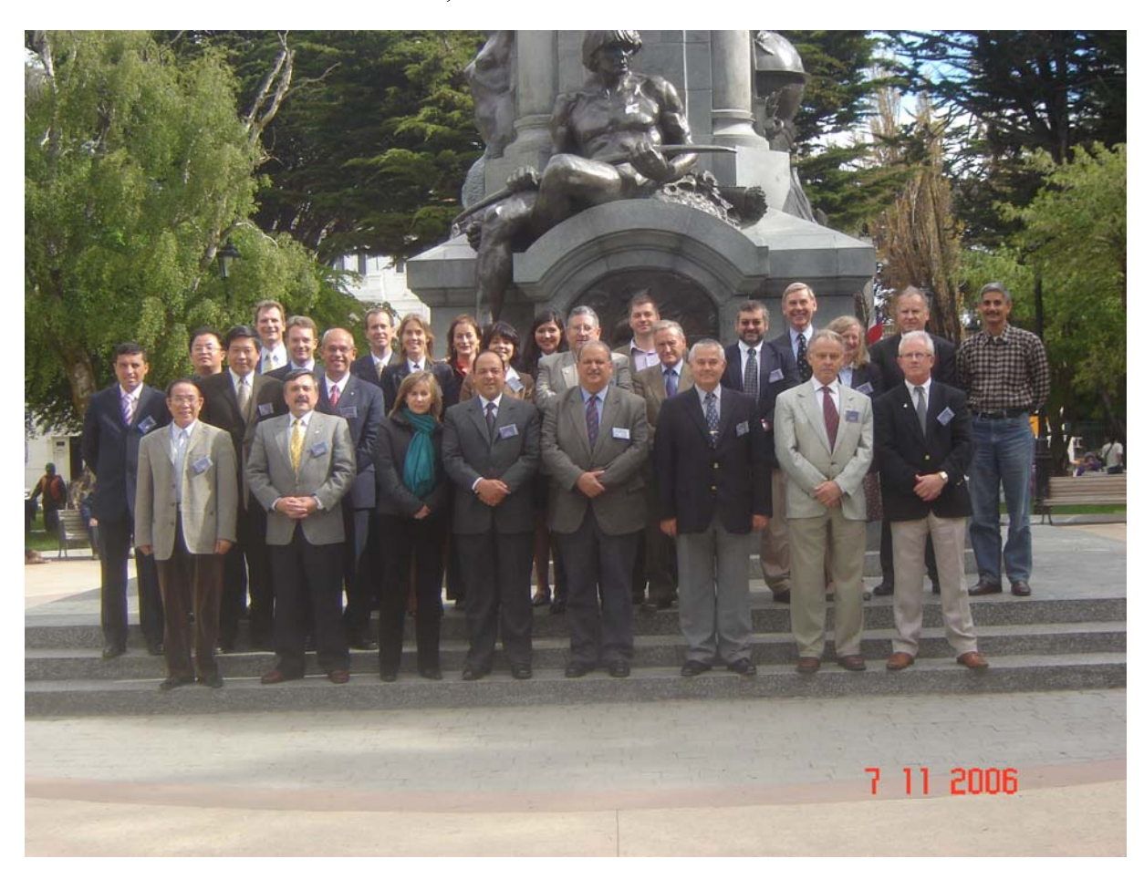
The 6<sup>th</sup> Meeting of the Hydrographic Committee on Antarctica (HCA) took place at the Chilean Antarctic Institute (INACH), Punta Arenas, Chile, on 06-08 November 2006, organized by the Hydrographic and Oceanographic Service of the Chilean Navy (SHOA) and INACH. The following national authorities attended the Opening Ceremony: the Governor of the Magallanes Province, the

Brazil, Japan, Korea (Rep. of), Peru, Poland, Ukraine, Uruguay, USA. Antarctic Treaty Secretariat (ATS), Council of Managers of National Antarctic Programmes (COMNAP), Standing Committee on Antarctic Logistics and Operations (SCALOP), International Association of Antarctic Tour Operators (IAATO), Scientific Committee on Antarctic Research (SCAR), International Maritime Organization (IMO), Intergovernmental Oceanographic Commission (IOC), General Bathymetric Chart of the Oceans (GEBCO), International Bathymetric Chart of the Southern Ocean (IBCSO), IHO Data Center for Digital Bathymetry (DCDB), Australian Antarctic Division, Antarctica New Zealand.