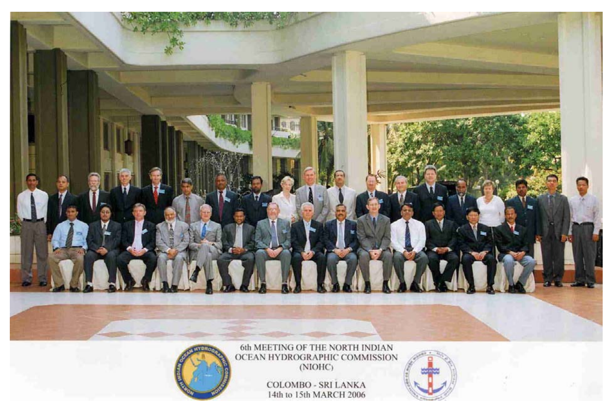
The 6<sup>th</sup> meeting of the North Indian Ocean Hydrographic Commission (NIOHC) took place in Colombo, Sri Lanka, from 14 to 16 March 2006. Thirty-seven persons participated in the meeting, representing the following States and Organizations: Bangladesh, France, Germany, India, Myanmar, Oman, Pakistan, Saudi Arabia, Sri Lanka, Seychelles, Thailand, UK, USA, Yemen, IHB, IOC and