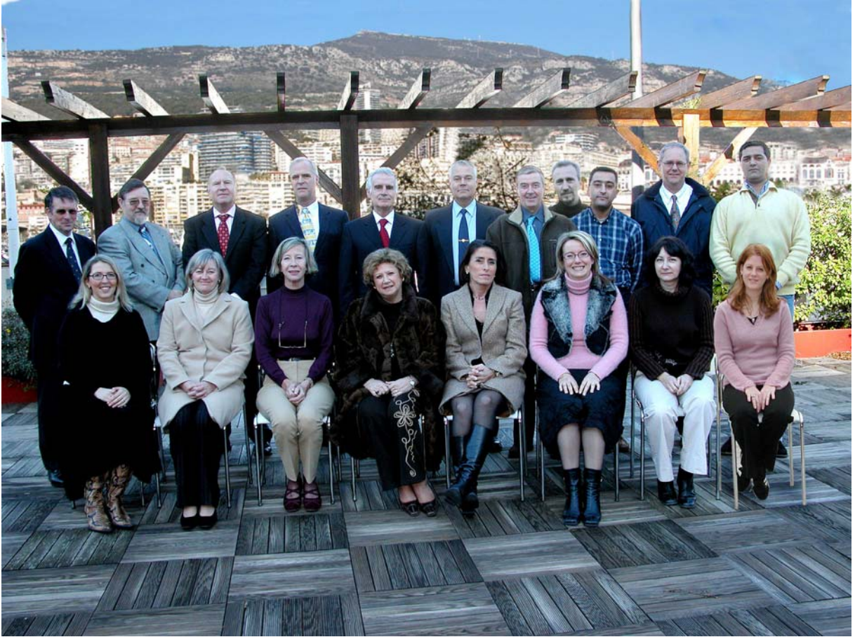
IHB Staff in 2006