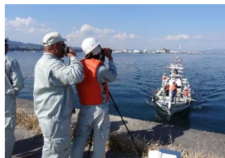
one-month field survey training

The participants are also taught data processing using GIS software to utilize hydrographic data, and visit several factories and research institutes to see state of the art technology and also visit the damaged areas of the 2011 tsunami disaster in Japan to see restoration activities and disaster management for future disasters.