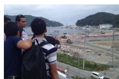
visit to tsunami devastated area