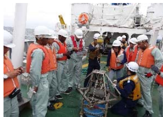
on-board training on JHOD's survey vessel