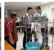
visit to tsunami devastated area