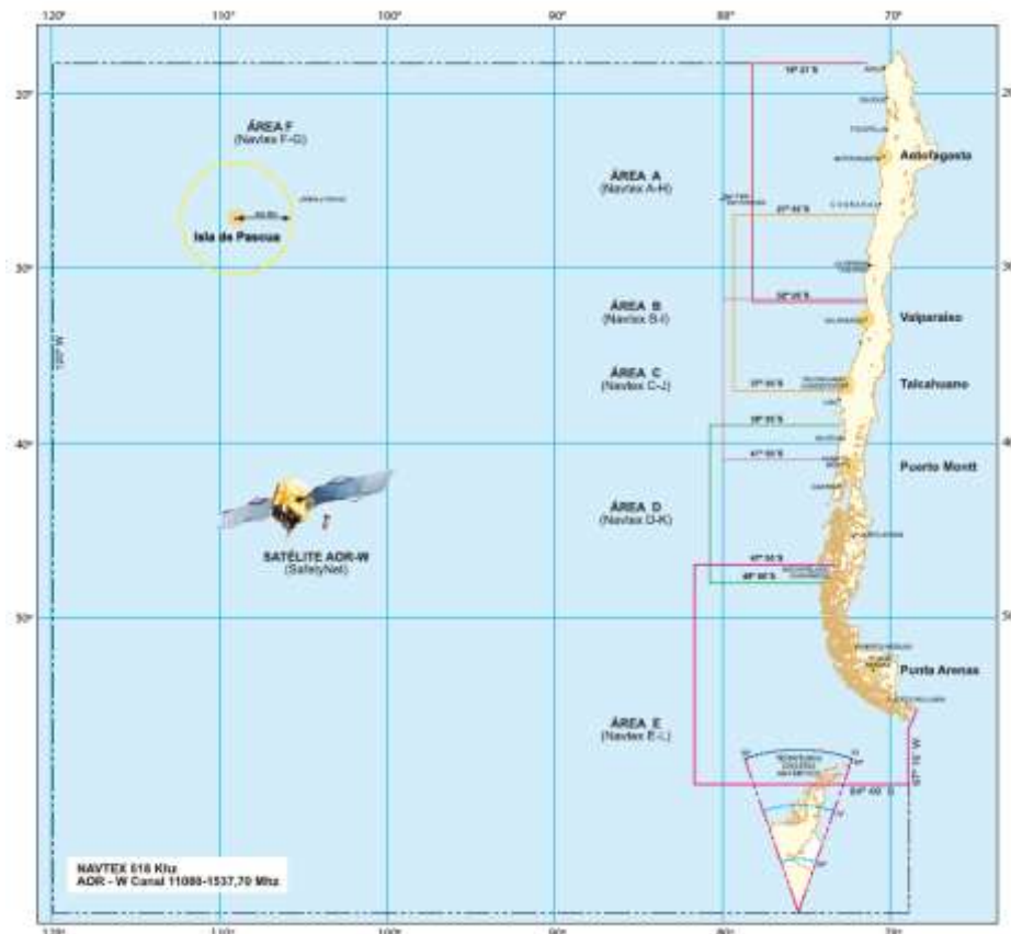
Diagram of NAVTEX stations and service areas within NAVAREA XV