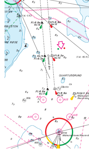
DK Chart 189 Bornholmsgat