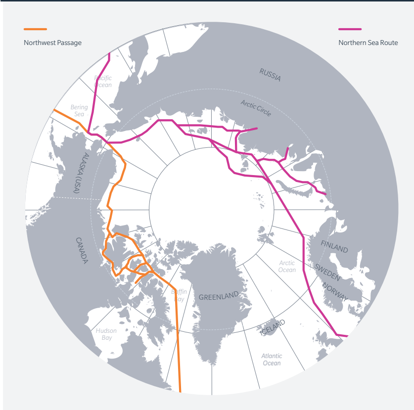
FIGURE 4 The Arctic Sea Routes

The lack of hydrographic data for the Arctic region should remain a major concern for any sensible operator.