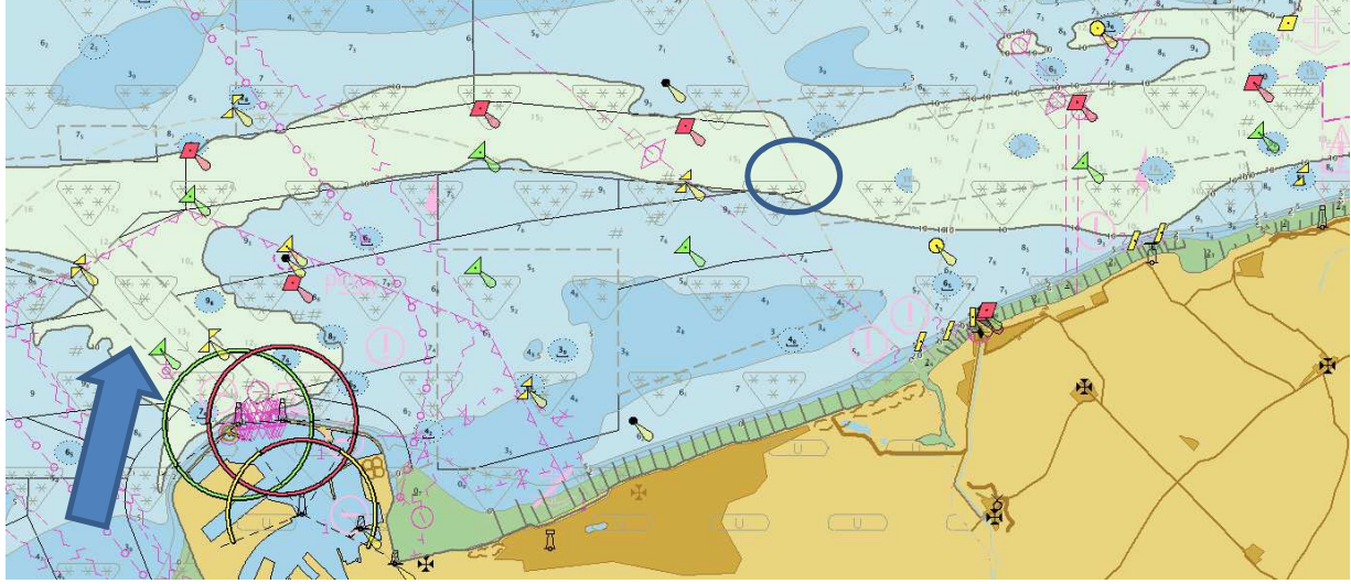
Figure 2: same view with Meta objects shown.

Figure 2 shows the same view but now with Meta Objects on. The object M_QUAL (an area within which a uniform assessment of the quality of the data exitst) with attribute CATZOC (category of zone of confidence in data) is shown in grey with a triangle symbol facing down and star symbols (three crossing lines) inside. The number of stars inside each triangle represents the confidence level.