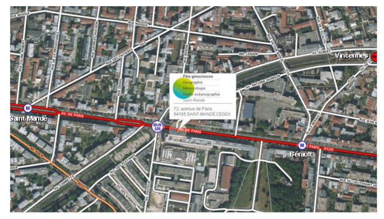
Pôle Géosciences -73 avenue de Paris – 94160 Saint Mandé (location and access).