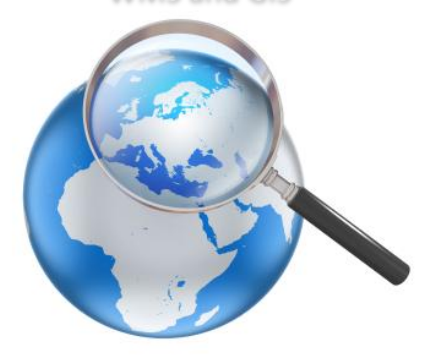
Web GIS is any GIS that uses WEB technology to communicate between its components.