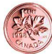
1 Cent Coin "Penny"