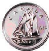
10 Cent Coin "Dime"