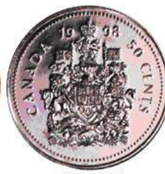
50 Cent Coin