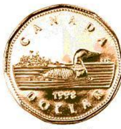
1 Dollar Coin "Loonie"