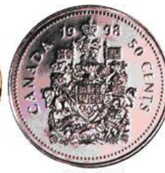
50 Cent Coin