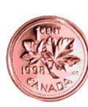
1 Cent Coin "Penny"