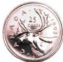
25 Cent Coin "Quarter"