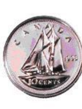
10 Cent Coin "Dime"