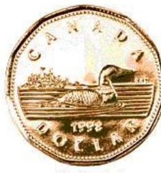
1 Dollar Coin "Loonie"