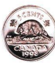
5 Cent Coin "Nickel"