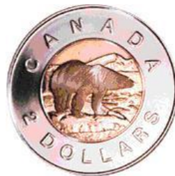
2 Dollar Coin "Toonie"