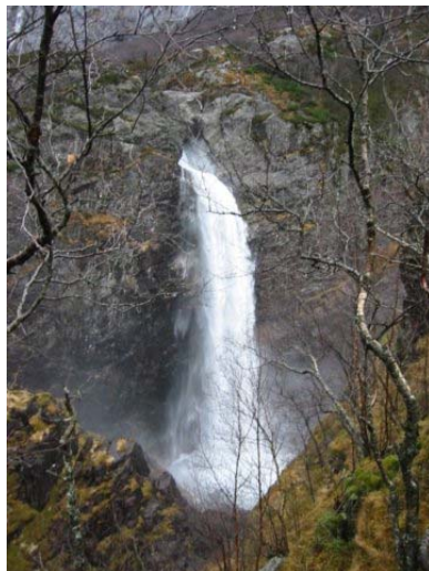
Mån water fall