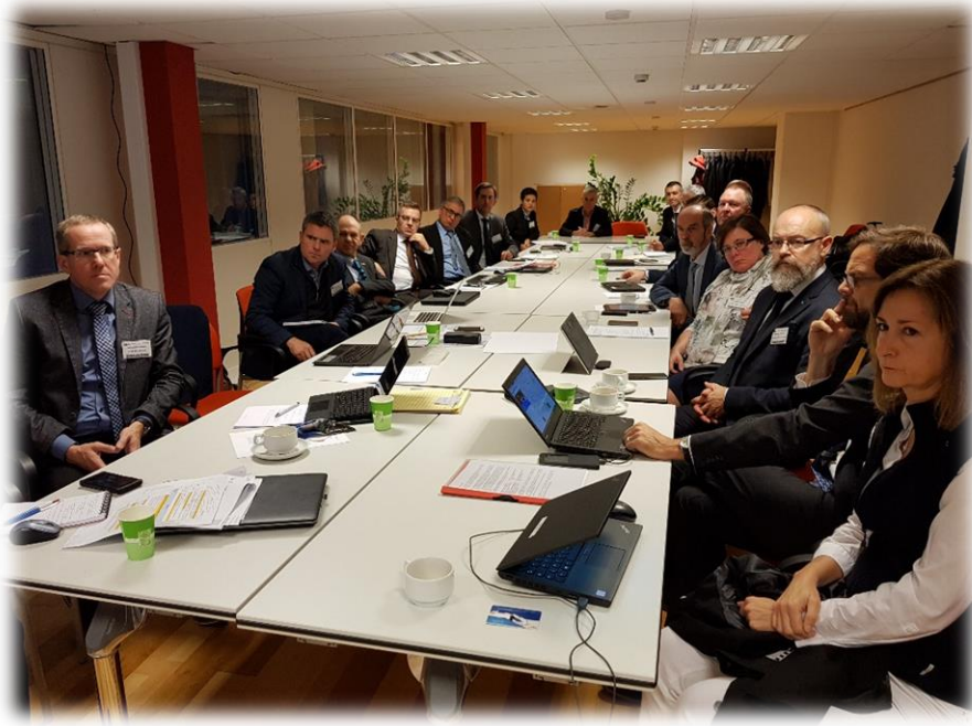
Participants at the 9 th IENWG meeting, Brussels, Belgium

(Netherlands Hydrographic Service) at the European Inspire 8 Conference in August 2018, where she was awarded with the Golden Pineapple Inspire Price for her contribution.