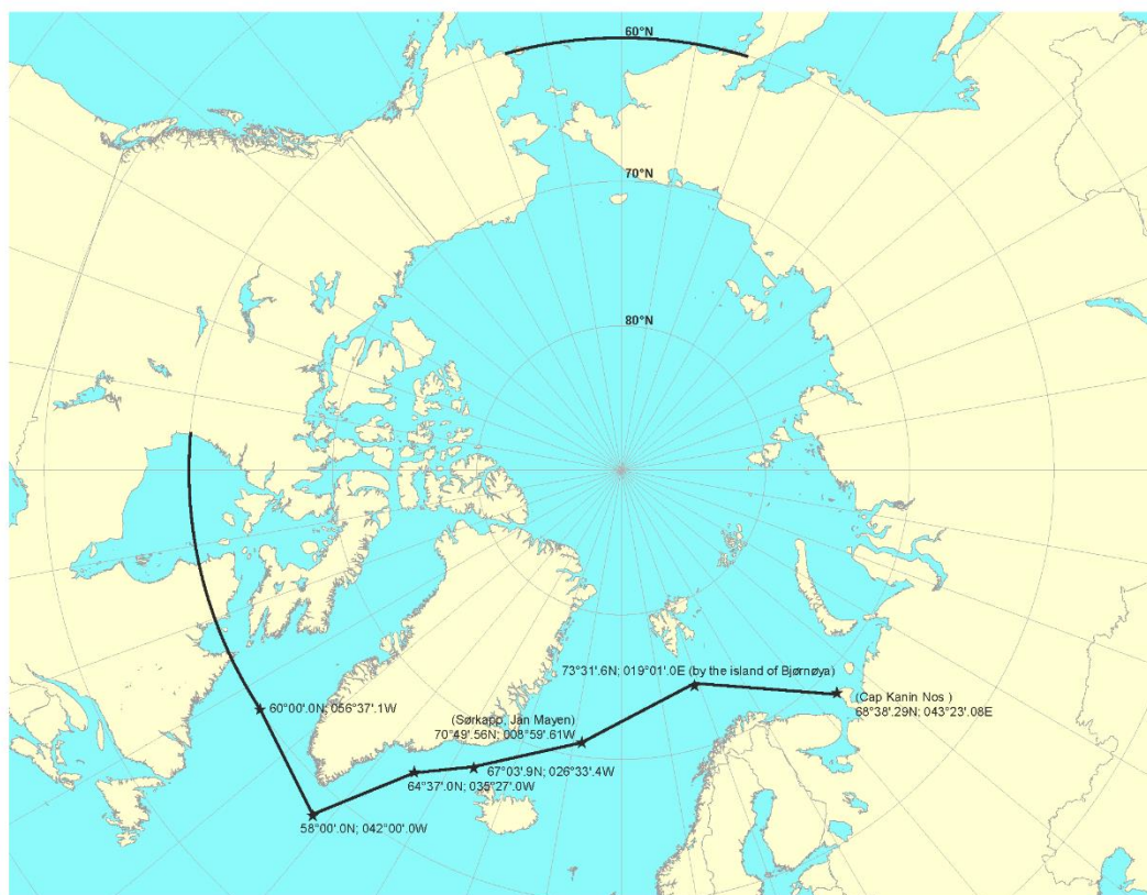
Figure 2 – Maximum extent of Arctic waters application 3