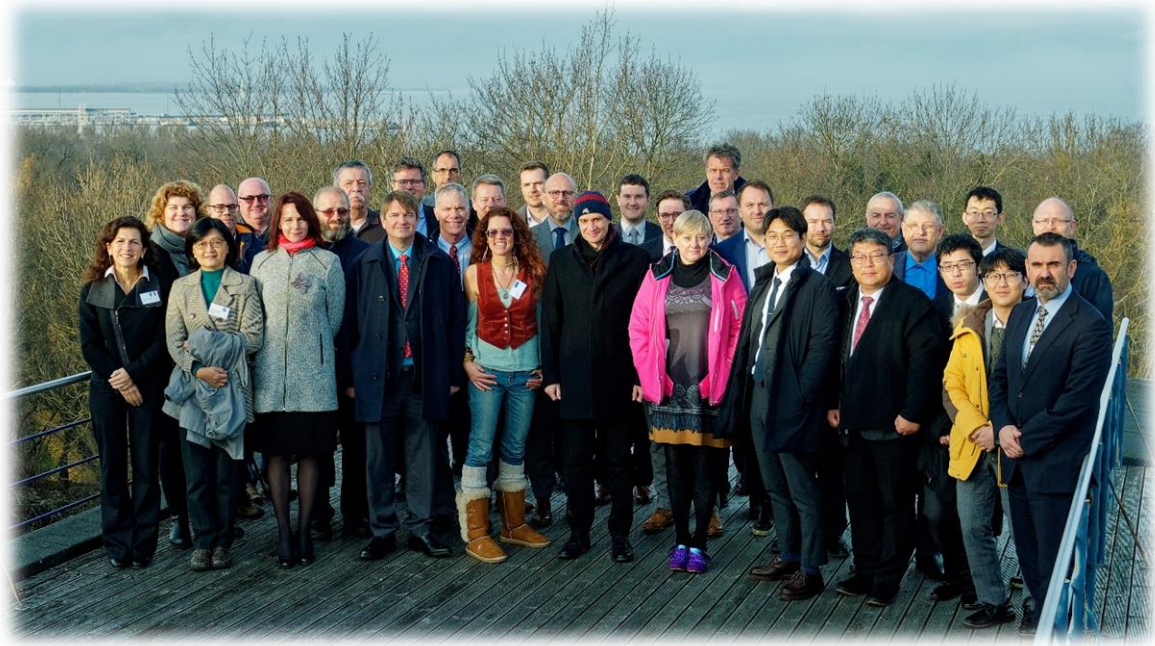
NIPWG-7 participants in Tallinn, Estonia