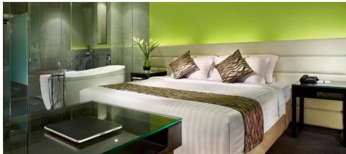
Executive Club Room