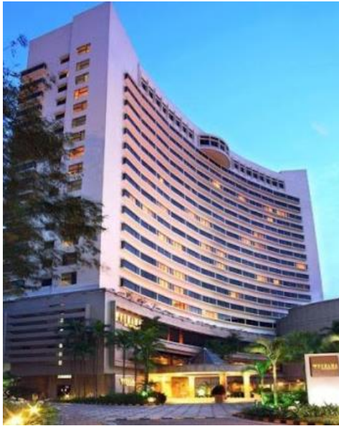
Furama RiverFront Hotel