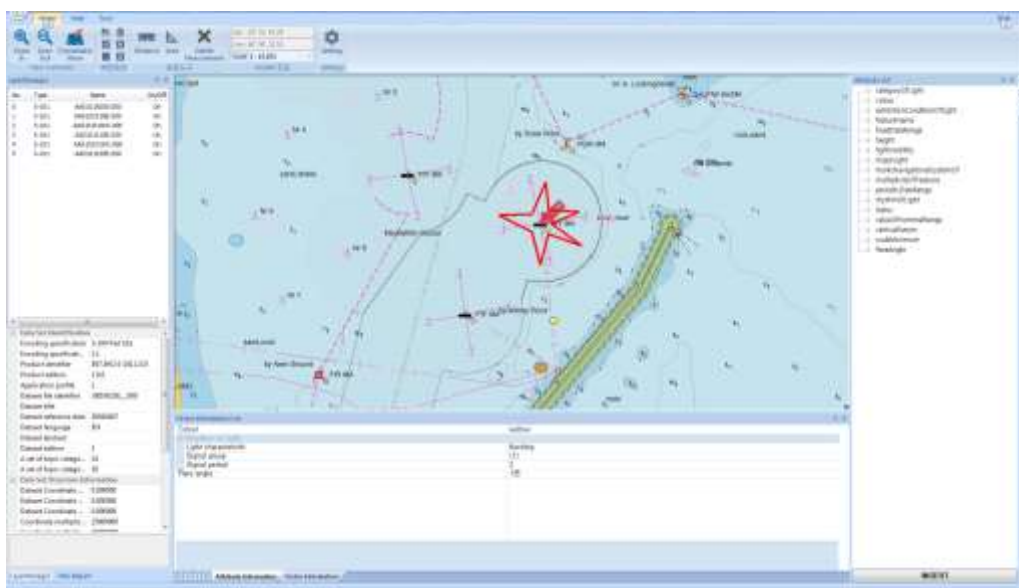
Fig 2. Current Status of S-100 Test Dataset Tool

Currently, in accordance with the S-101 Feature Catalogue Version 0.8.8, the baseline version has been completed with the functions to edit the converted S-101 features and to create Native ENC.