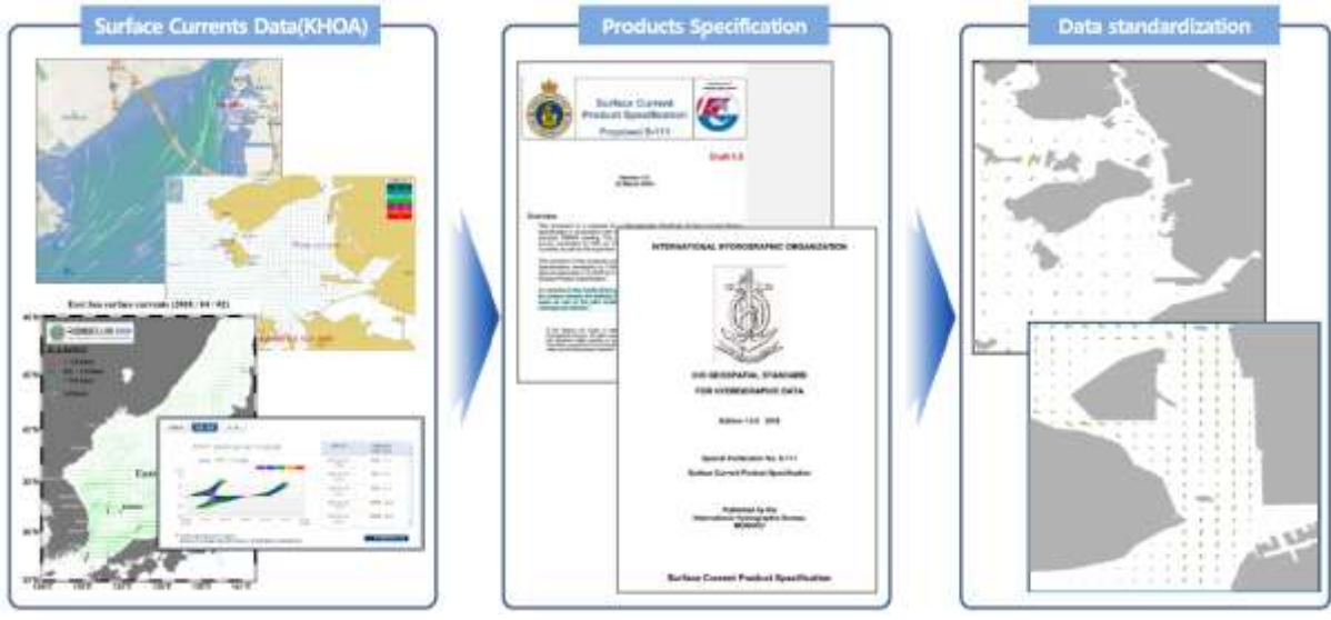
Fig. 3 S-111 Creation of S-111 surface current test datasets.

S-111 project team of TWCWG updated the product specification and test datasets. The S-111 test dataset consists of 4 types which are moving platform, fixed observation station, regular grid and irregular grid. Since the S-111 product specification was updated considering the revised structure of HDF-5 encoding in S-100 edition 4.0, KHOA will produce the test datasets based on the revised structure. In order to create the test data, HDF-5 library will be used and the coverage of creating test data sets will be in line with the S-101 ENC.