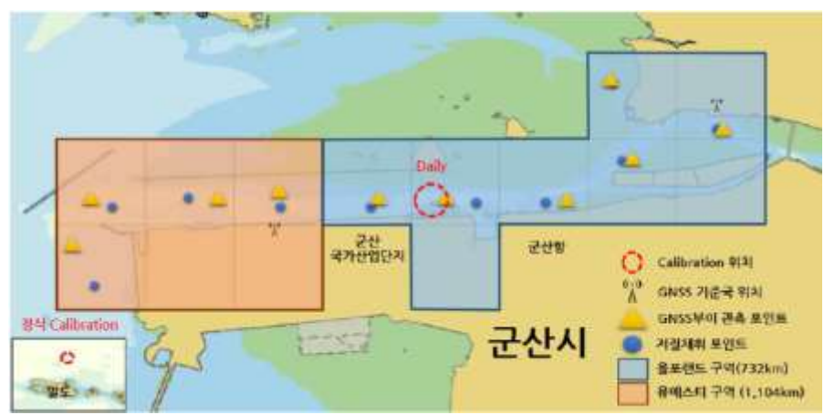
Fig. 2 S-102 Coverage of creating test datasets of S-102 Bathymetric surface grid

S-102 bathymetric surface grid will be created for the area of Gusan port in this year and the resolution will be considered in line with the usage band 6 of ENC.