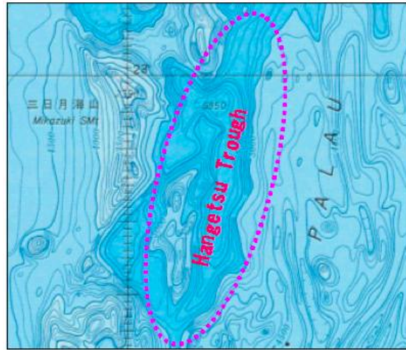
Fi.g 1. Screen capture of the Japanese chart 6722, showing the location of the Hangetsu Trough and Hangetsu Seamount.