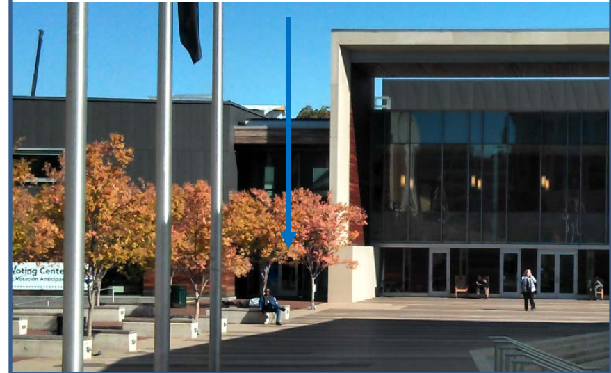
Veterans Plaza Corner of Ellsworth Drive & Fenton Street

Entrance is to the left of the white & glass façade.