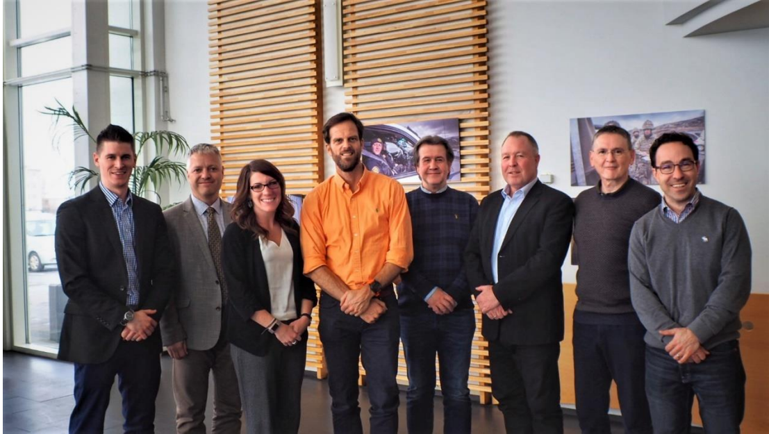
Figure 1 Participants of ARMSDIWG3 - Reykjavík, Iceland

Additionally, the working group discussed current and future collaboration with other applicable working groups, including the OGC Marine Domain Working Group (Marine DWG) as well as the United Nations Committee of Experts on Global Geospatial Information Management Working Group on Marine Geospatial Information (UN-GGIM WG-MGI). ARMSDIWG spent considerable time deliberating over the details of strengthened cooperation with Arctic SDI and editing a Joint Statement of Intent.