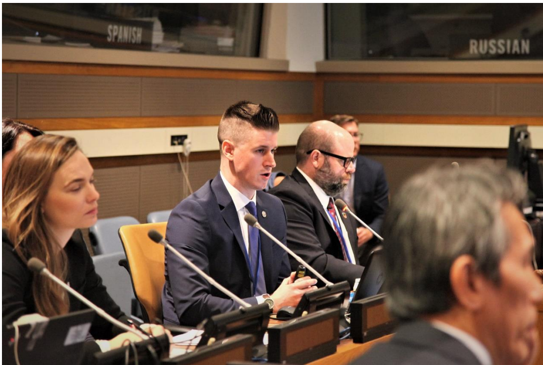
Figure 3 Chair ARMSDIWG presenting during the panel “Readily available and accessible marine geospatial information – Regional Practices in the Arctic” at the UN-GGIM Working Group on Marine Geospatial Information Side Event – United Nations Headquarters, New York

The UN-GGIM was so interested in the ARMSDIWG and Arctic SDI collaboration that both Chair ARMSDIWG and Chair of the Arctic SDI Board were invited to participate in a Roundtable on Availability, accessibility, application, provenance, privacy and protection of geospatial information hosted by the Working Group on Legal and Policy Frameworks for Geospatial Information Management during a panel on Enabling regional collaboration and applications . Both Chairs of Arctic SDI and ARMSDIWG spoke to: “Data sharing across borders enables regional collaboration and partnerships, ensure that governments and related stakeholders can discover, access and apply data to coordinate, address and respond to issues and emergencies. This panel seeks to understand from experiences of regional initiatives vis-à-vis legal and policy, including from partners of the Arctic SDI that are facilitating better access to data related to the arctic environment.”