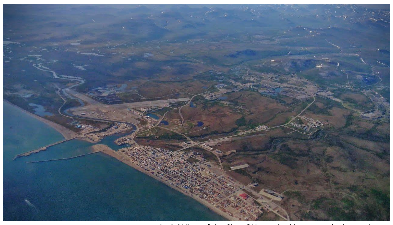
Aerial View of the City of Nome, looking towards the northwest