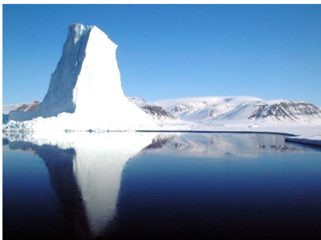
An iceberg at the edge of Baffin Bay's sea ice is just one of the many sights from Thule Air Base, Greenland.

The Arctic 1 is at a strategic inflection point as its ice cap is diminishing more rapidly than projected 2 and human activity, driven by economic opportunity—ranging from oil, gas, and mineral exploration to fishing, shipping, and tourism—is increasing in response to the growing accessibility. Arctic and non-Arctic nations are establishing their strategies and positions on the future of the Arctic in a variety of international forums. Taken together, these changes present a compelling opportunity for the Department of Defense (DoD) to work collaboratively with allies and partners to promote a balanced approach to improving human and environmental security in the region in accordance with the 2013 National Strategy for the Arctic Region . 3