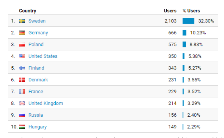
Figure 1 Top ten countries using the portal July 2017-July 2018

The last year Sweden, Germany and Poland has been the most frequent users of the BSBD portal and together they stand for 51.36% of the visitors.