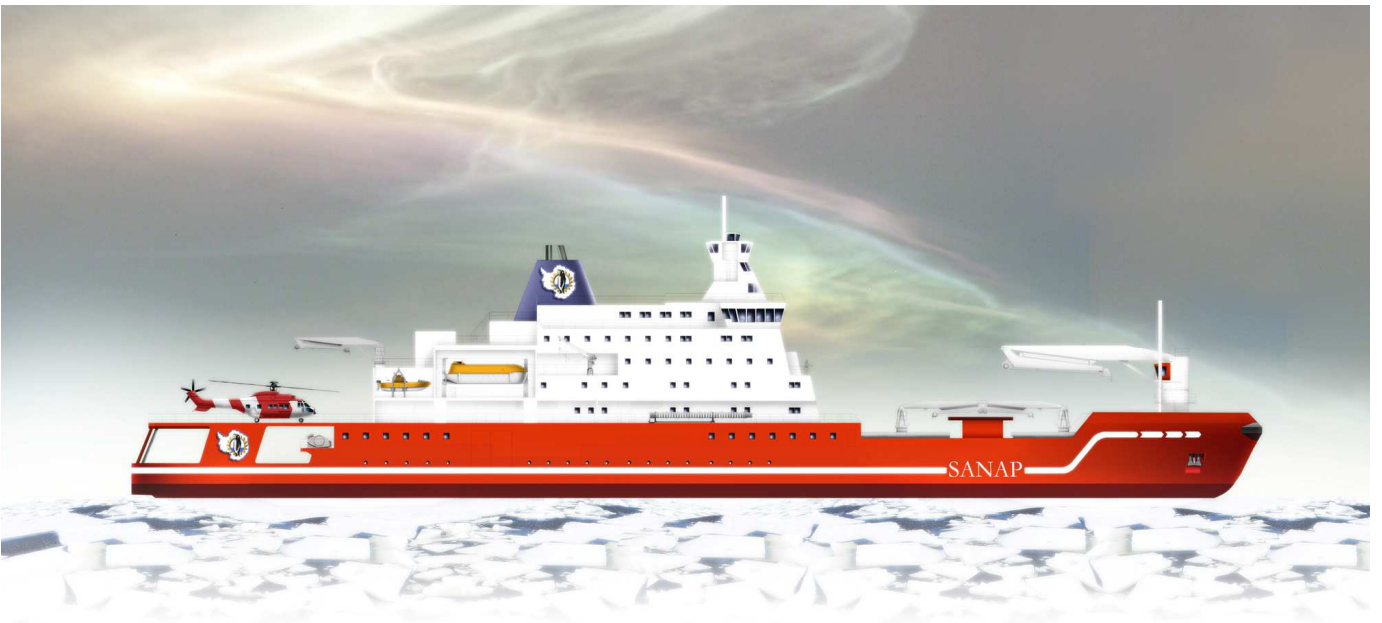
Figure 5. M/V SA AGULHAS II