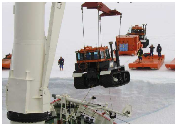
Figure 7. Offloading at Akta-bukta

South Africa will welcome any additional survey data including satellite imagery (geo-referenced) within their charting area from neighbouring countries to update chart SAN 2004 (INT 9056) and ENC ZA300300.