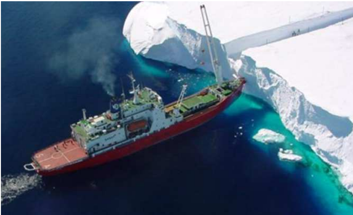
Figure 3. M/V SA AGULHAS 1