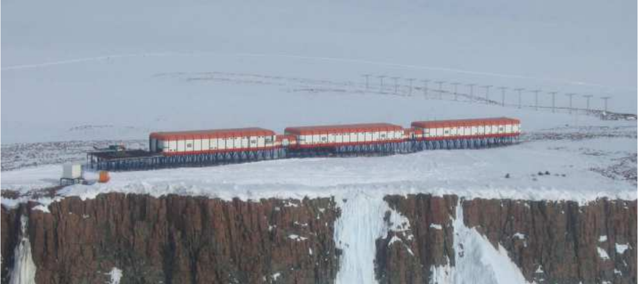
Figure 4. SANAE IV