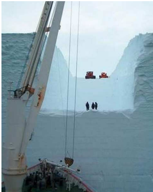
Figure 6. Offloading at SANAE III

Since the summer season of 2004/2005, the MV AGULHAS discharged cargo at the Akta-bukta in the vicinity of the German research station Neumayer. Due to the ever-increasing height of the ice-shelf in the vicinity of the abandoned SANAE III, it has become extremely dangerous to back-load and discharge cargo from the +32 metre high and very unstable ice-shelf. South Africa and Germany has exchanged source information in preparation of their now published adjoining paper charts INT 9057, INT 9055 and ENC. This has enhanced the existing co-operation between South Africa and Germany.