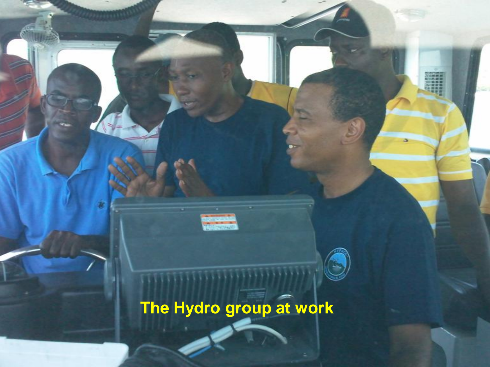
The Hydro group at work