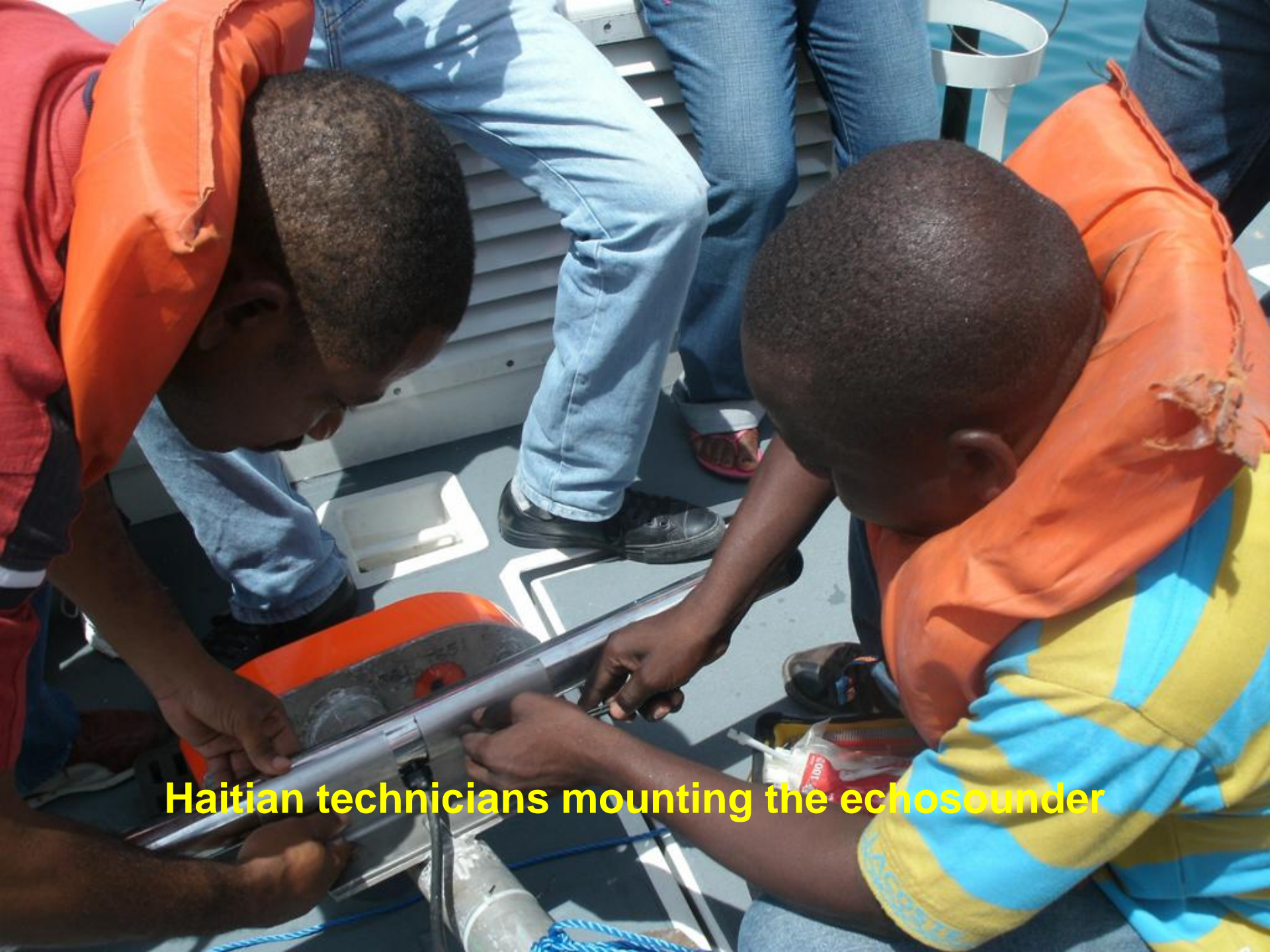
Haitian technicians mounting the echosounder