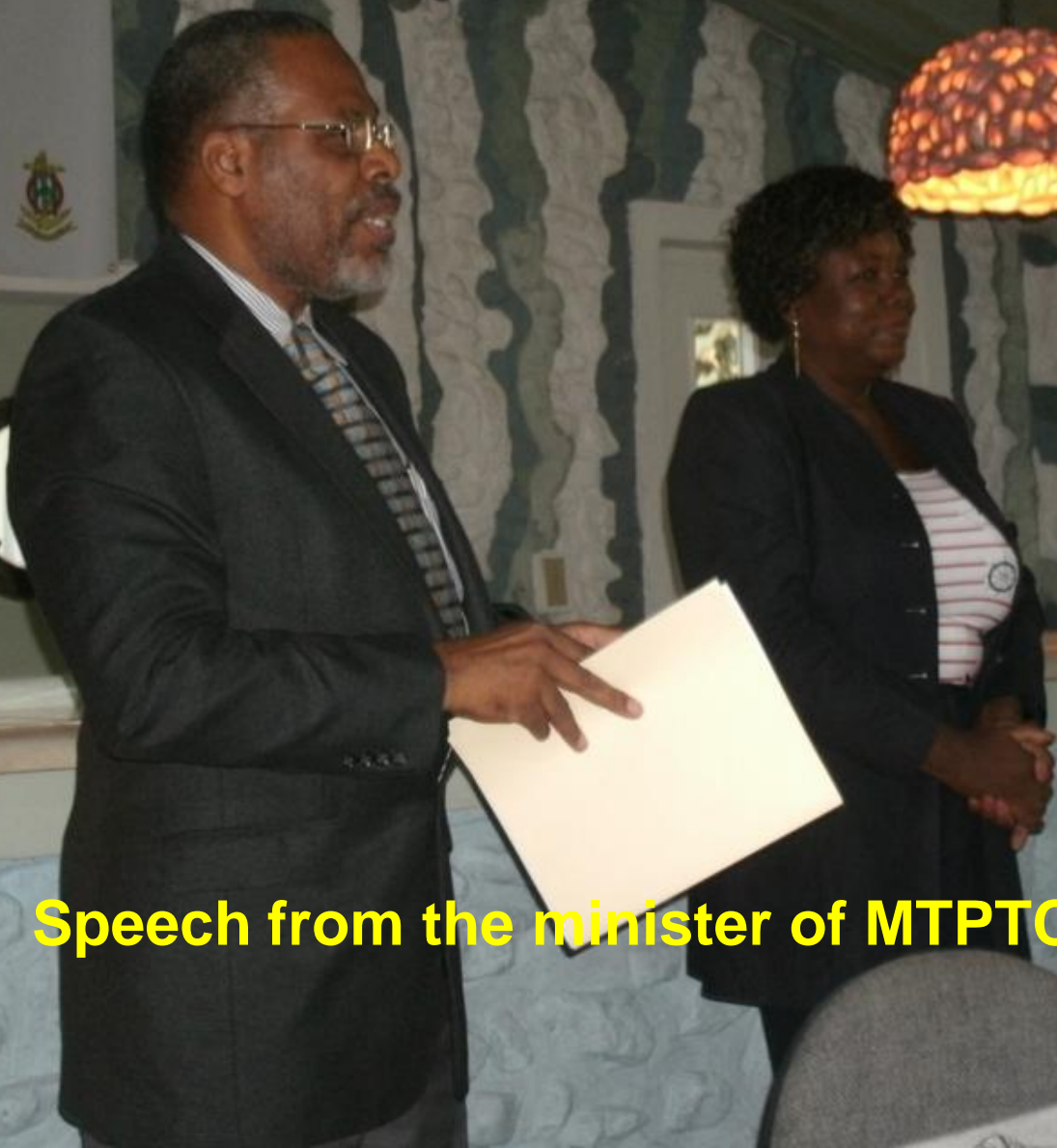
Speech from the minister of MTPTC

Ministère d'Haïti Des Transports et Communications et de Navigation d'Haïti MANAH et la Cartographie Marine septembre 2011 by Beach Hôtel, des Arcadins.