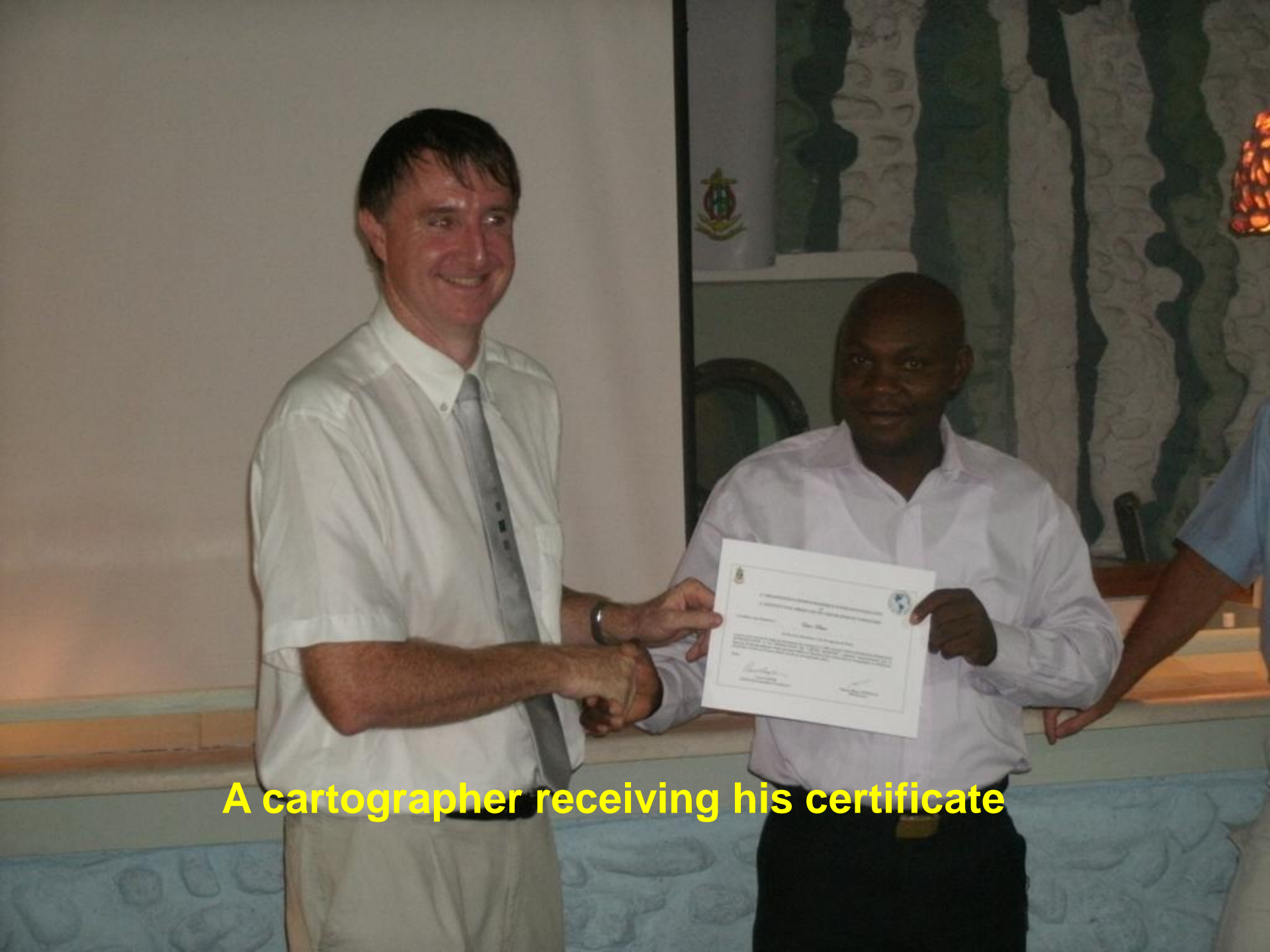
A cartographer receiving his certificate