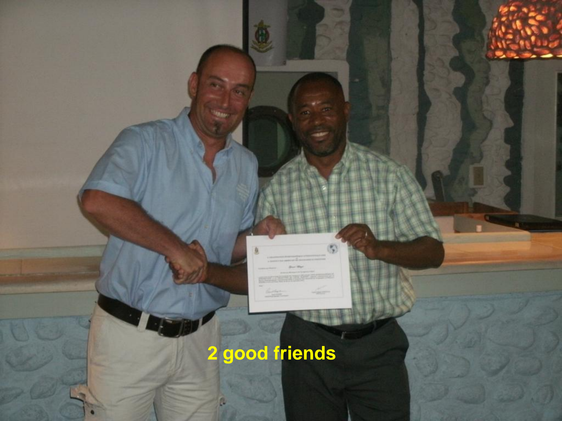
2 good friends