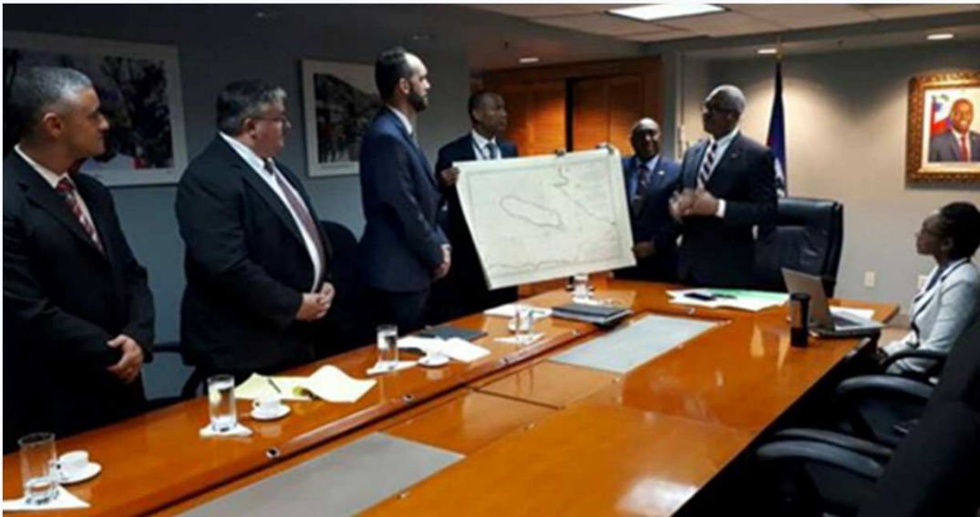
Haiti Prime Minister Dr. Jack Guy Lafontant