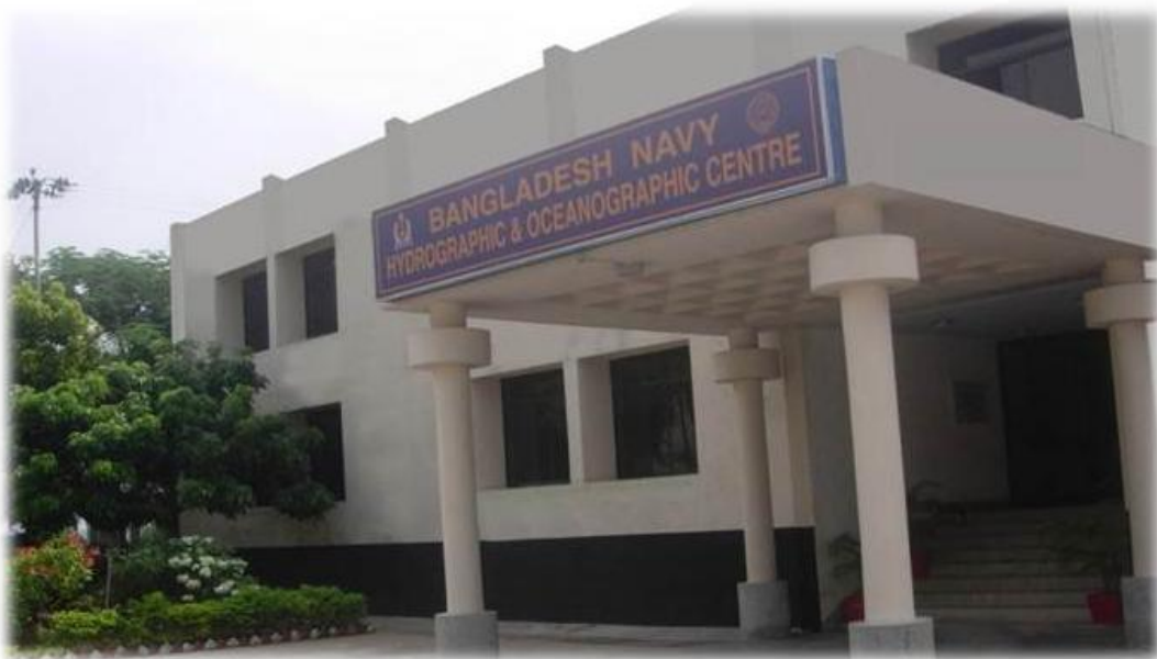
BN Hydrographic and Oceanographic Centre at Chittagong

1.2. In Bangladesh, all the hydrographic activities of the country are coordinated through National Hydrographic Committee (NHC). NHC addresses the hydrographic and other related maritime activities at the national level. Different ministries and stakeholders are the members of NHC. The Assist Chief of the Naval Staff (Operations) of Bangladesh Navy is the Chairman of the Committee.