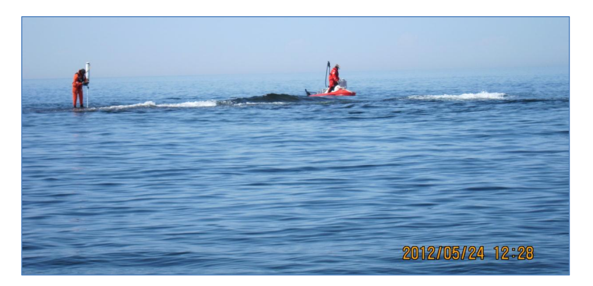
Fig 2 Personnel from the Swedish Hydrographic Office perform field work for a revised Swedish baseline. Here a beautiful day in May 2012.