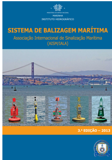
Figure 6 – Maritime Buoyage System and other Aids to Navigation

recent data and an effort to automate the tidal stations, in order to allow a near real time direct loading of values on the database and consequent dissemination to users.