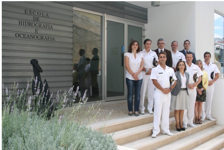
Figure 8 – IHPT School of Hydrography and Oceanography