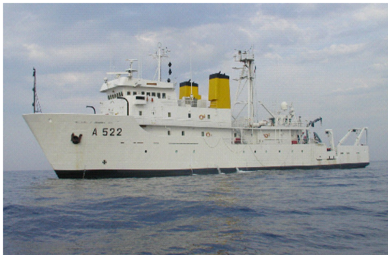
Figure 1 – Hydrographic ship NRP “D. Carlos I”.

To execute the hydrographic surveys IHPT has two oceanic hydrographic ships NRP “D. Carlos I” and NRP “Almirante Gago Coutinho” well equipped (see figure 1). Each one have one multibeam echosounder system for deep waters (KONGSBERG EM 120) and NRP “Almirante Gago Coutinho” also have a multibeam system for medium depths (KONGSBERG EM 710). Each ship may carry a small survey launch with a multibeam echosounder system for shallow waters.