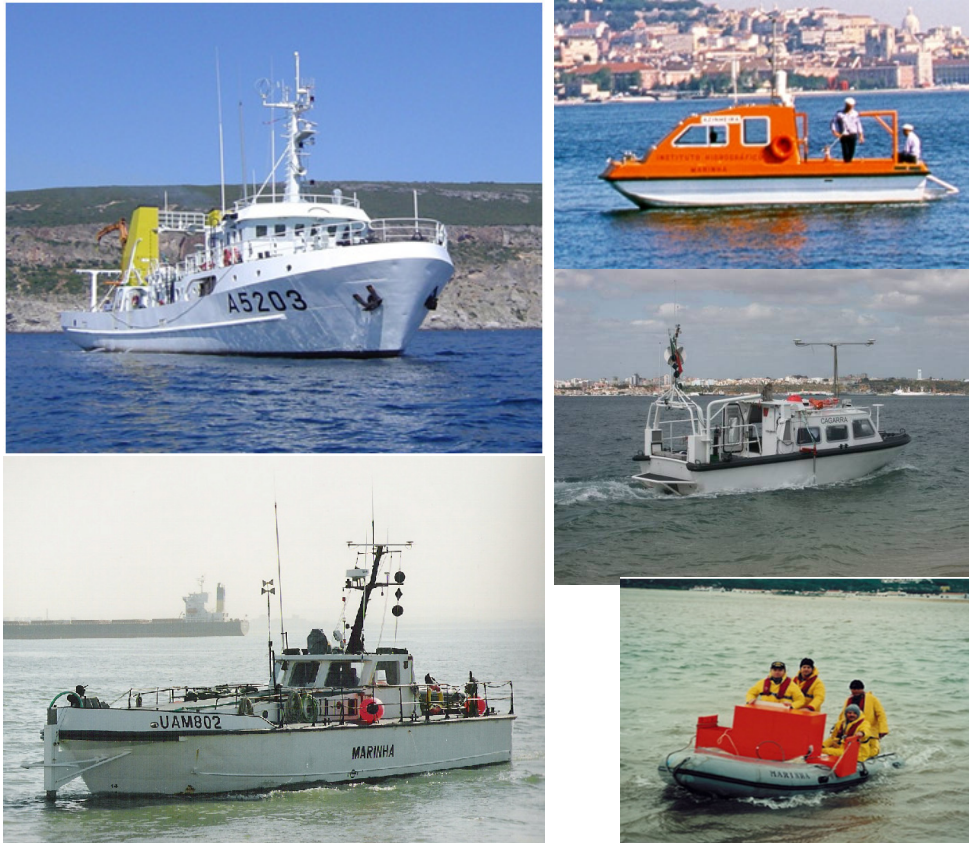
Figure 2 – Coastal hydrographic ship and survey launches.

To survey in shallow waters, IHPT have two portable systems (KONGSBERG EM 3002) on the Hydrographic Brigades.