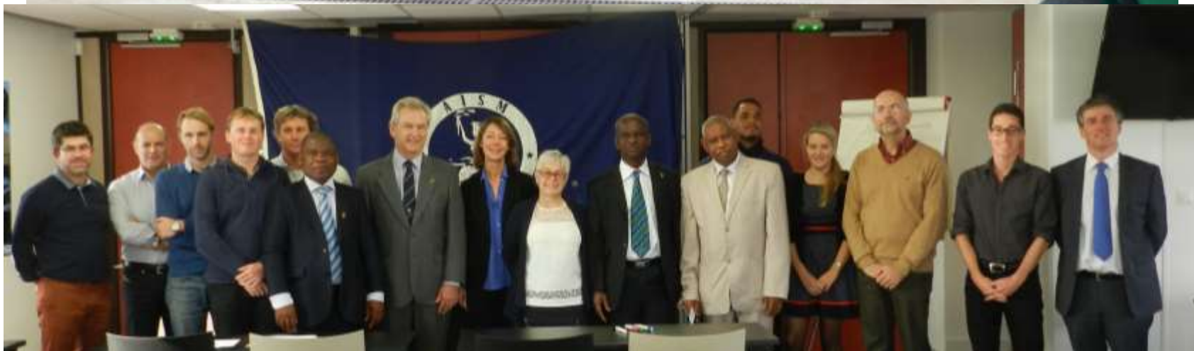
Level 1, IALA HQ, October 2015