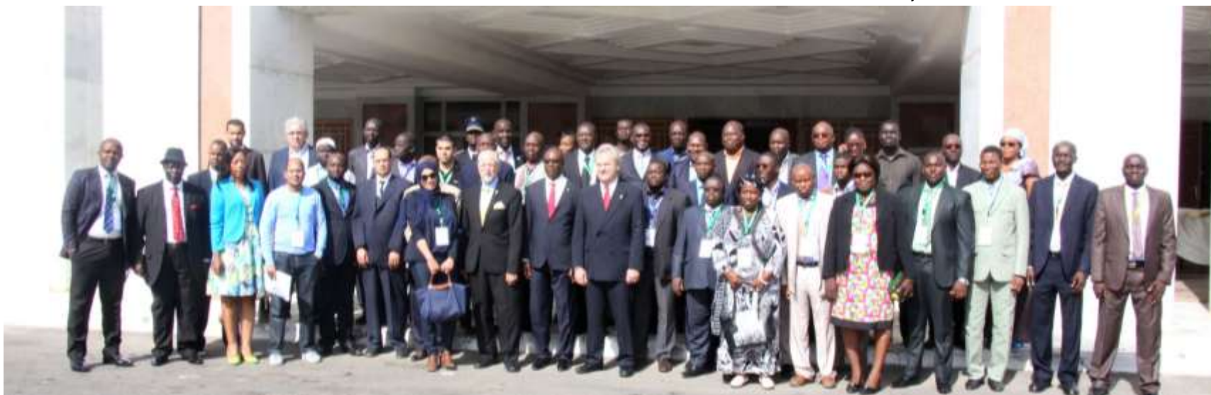
Dakar, December 2015