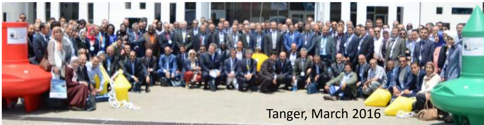
Tanger, March 2016