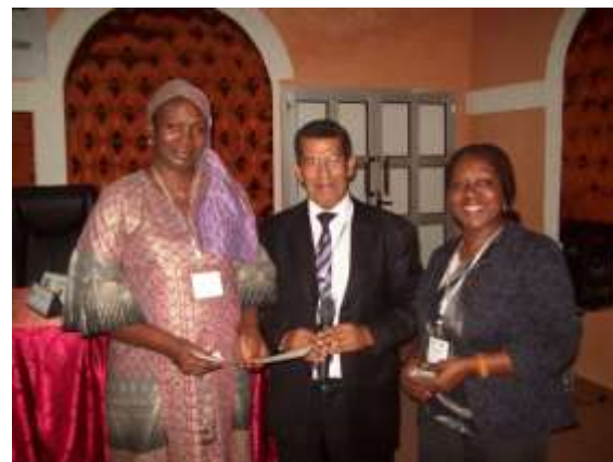
Nouakchott, March 2014