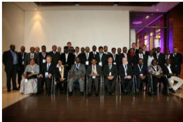
Cape Town, May/June 2012