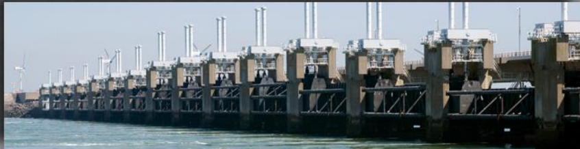
BUILDING, INFRASTRUCTURE & TELECOMMUNICATIONS

Our Offshore Survey services are used by a broad range of commercial and civil industries, as well as by governments and NGOs.