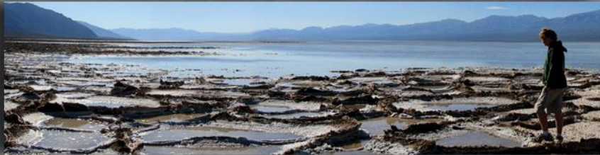
WATER, WEATHER & ENVIRONMENT