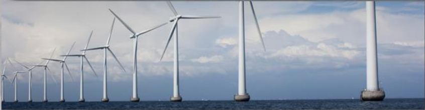
MARINE RENEWABLE ENERGY