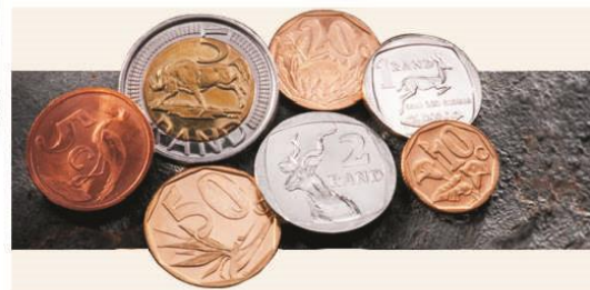
The 5c is no longer in circulation