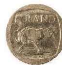
This older R5 is still in circulation

Some of these older notes are still in circulation