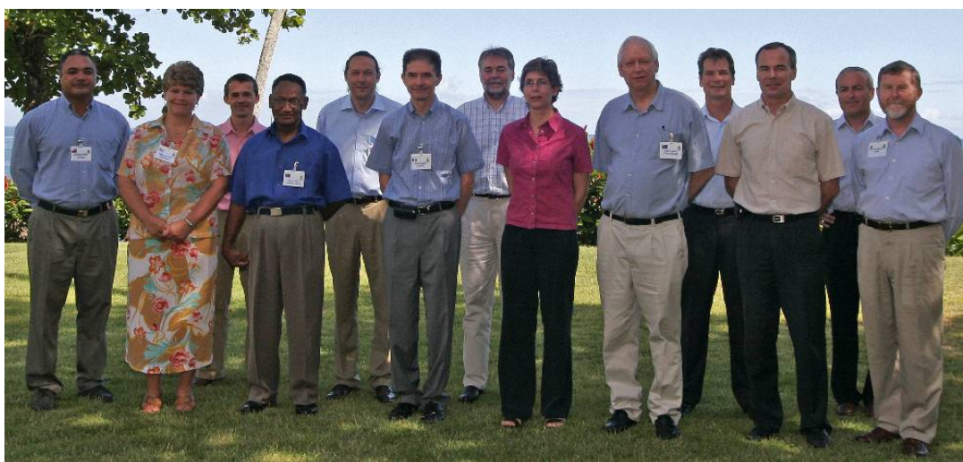
Delegates and Officials