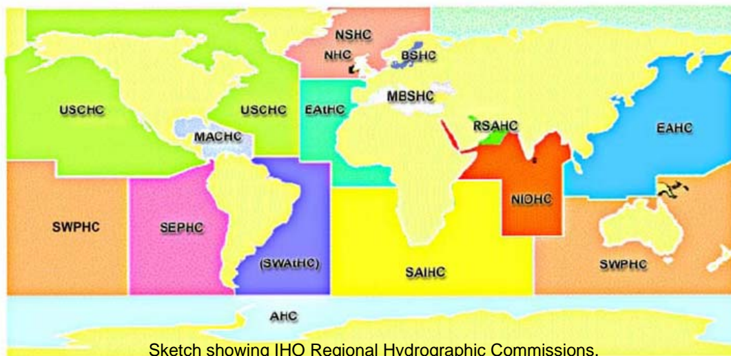
Sketch showing IHO Regional Hydrographic Commissions. Extent of the SWPHC area shown in orange

Papeete, Tahiti, France 18 – 20 septembre 2007